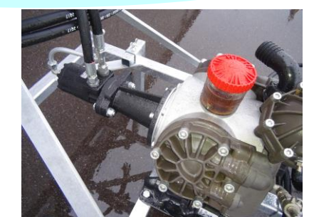
Hydraulic Drive of pump